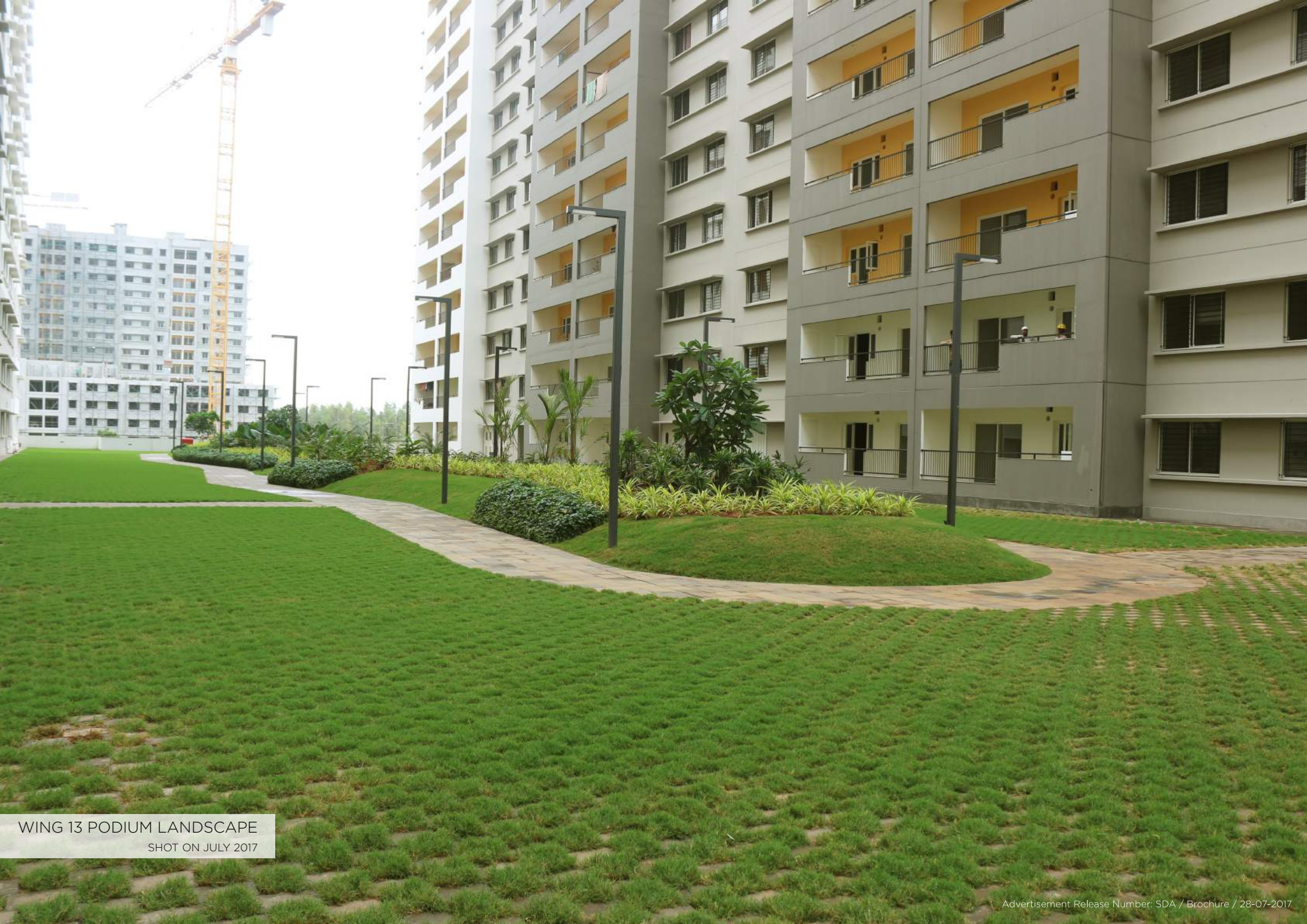
WING 13 PODIUM LANDSCAPE SHOT ON JULY 2017