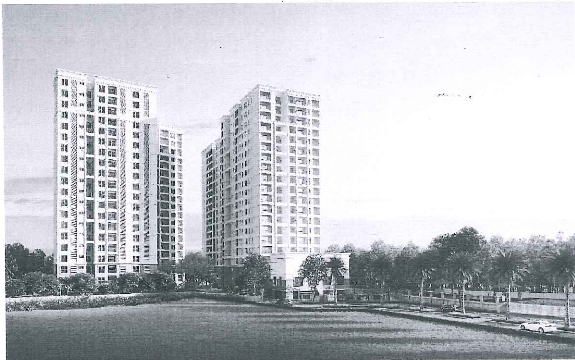
Artistic impression of Sobha Winchester, Chennai

The composition of Sobha Winchester is triple basement + ground + 19-storied RCC framed structure with concrete block masonry walls. It has covered parking at the basement for the occupants and parking on the ground floor for visitors. The project will have superior quality vitrified/ceramic tiles for flooring & skirting in the bedrooms, foyer, living & dining area. Plastic emulsion paint would be used for walls and ceiling.